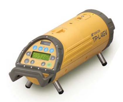
TP-L4 SERIES Pipe Lasers

The best way to get started is to call your Topcon dealer today.